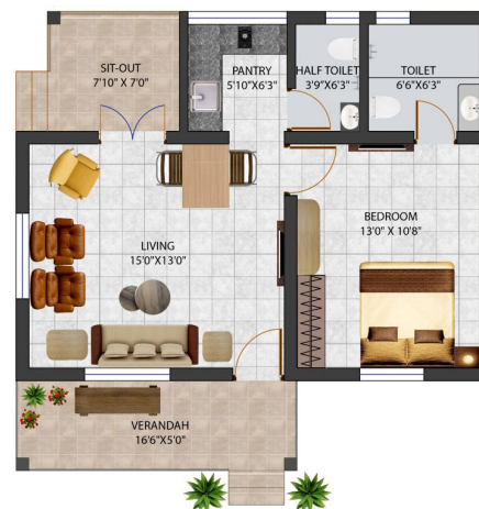
Presentation Floor Plan