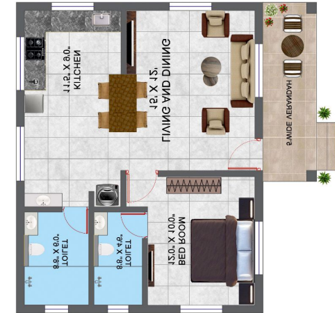
Presentation Floor Plan

2 BHK Bungalow : Built-up 825 Sqft. Carpet 715 Sqft.